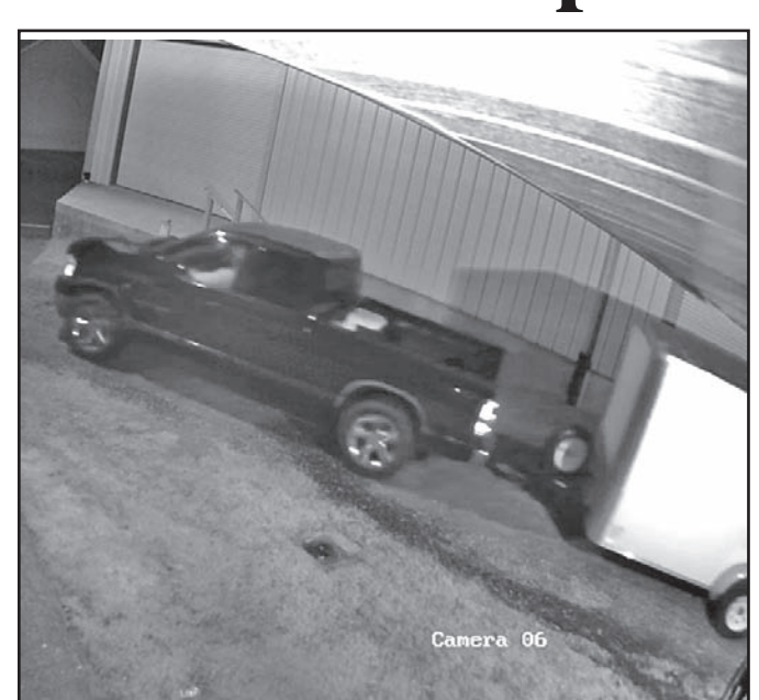
Hiawassee Police are looking for this Dodge truck.

'In the security video, See Hiawassee PD, Page 6A