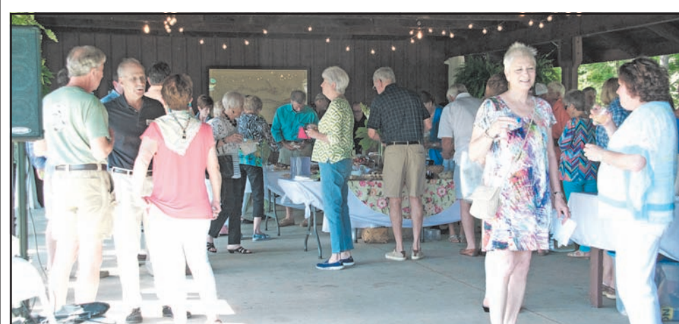
Dozens of plant lovers attended the May 20 benefit for the Hamilton Gardens at Lake Chatuge on Saturday.