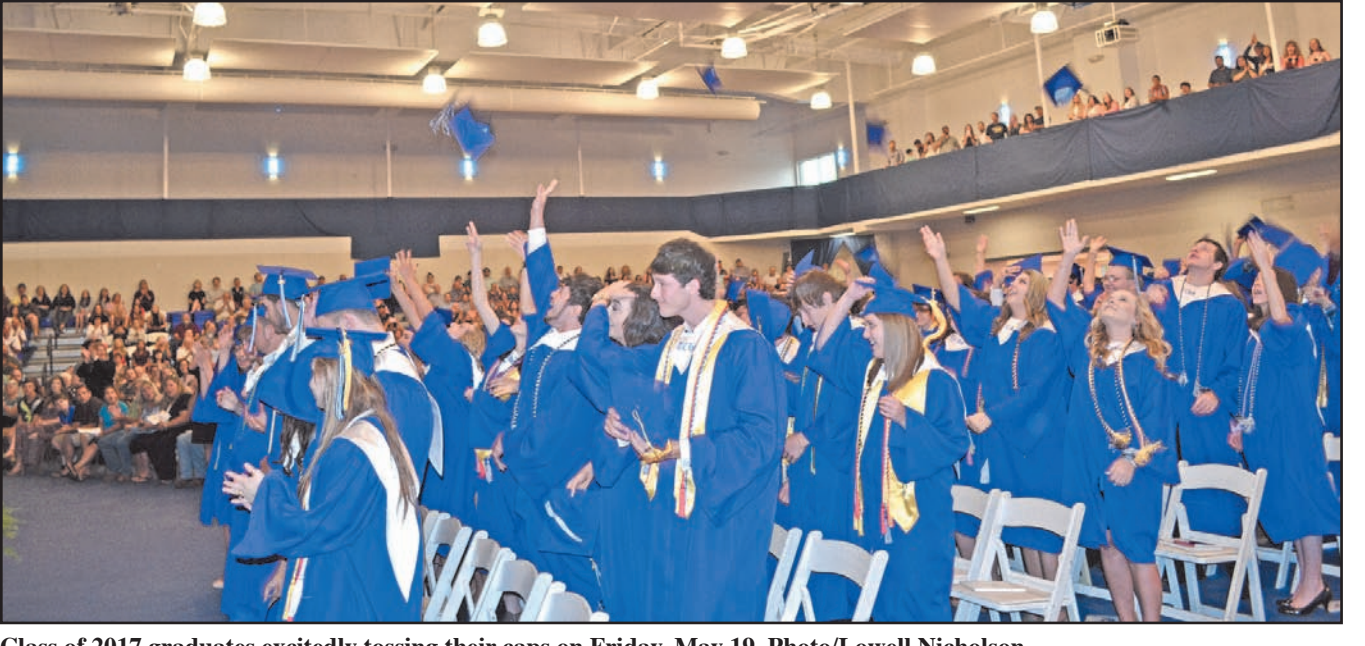
Class of 2017 graduates excitedly tossing their caps on Friday, May 19.