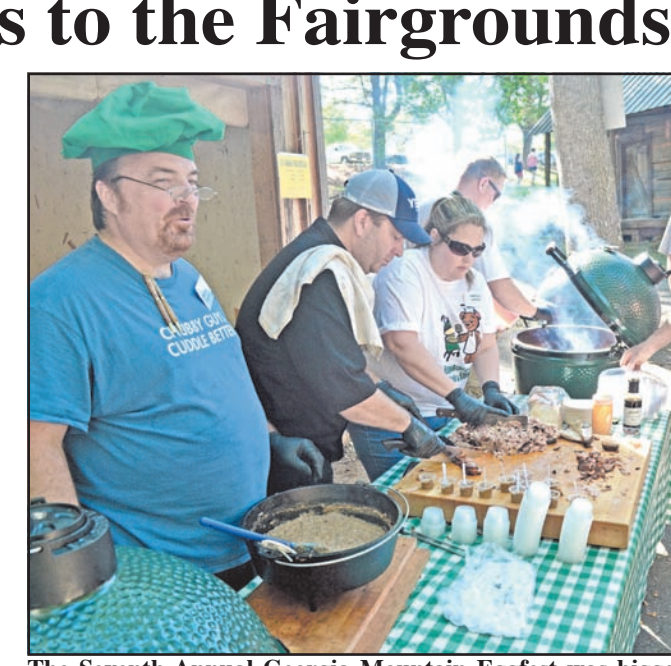
The Seventh Annual Georgia Mountain Eggfest was bigger than ever before.

2 Sections 20 Pages Arrests Lake Levels Blue Ridge 1 Chamber Church Chatuge Classifieds Nottely Opinion Legals 4A 8B